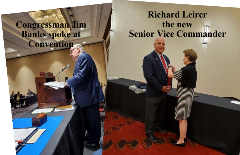
Congressman Jim Banks spoke at Convention