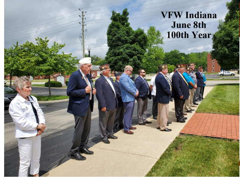
VFW Indiana June 8th 100th Year