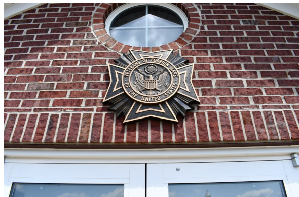
VFW State building