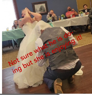
Not sure what he is doing but she is enjoying it!