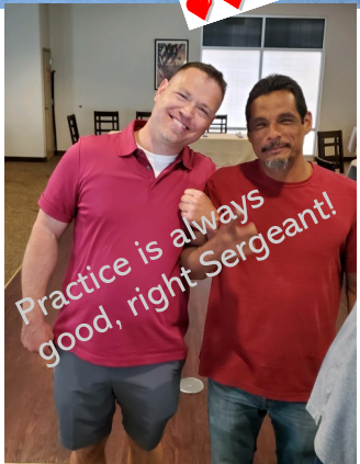
Practice is always good, right Sergeant!