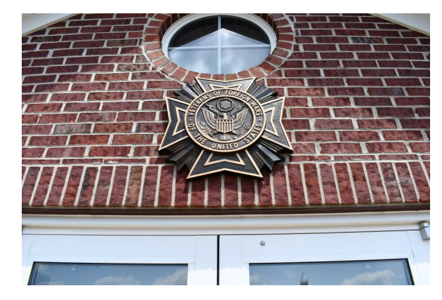
96th St. Round-a-bout